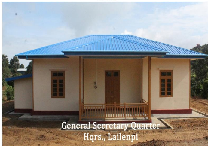
General Secretary Quarter Hqrs., Lailenpi

Published by The Christian Education Department Mara Evangelical Church Hqrs., Lailenpi/ Sabawngpi