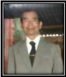
Machâ Raikô (Chakhai (N) Local Church)

Machâ Raikô he Chakhai (New) liata a laiseihpa a châ. Khazohpa ta a pavaosapa raihria zydua ngâchhih kawpa ta hria tyh ta, a sapa kô 69 apha hai nota September 15, 2017 noh ta Abeipa Khazohpa hnôhta maniah a pahasai haw. Ano he Village Council liata 1970- 1988 taih kô 18 chhôn khih nata râh châta rai a vaw chakao. 1989 ta Awnano Macha ta chahnaopa a châ. 2012 tawhta Chakhai Old Local Hyutuha ta term kha a vaw chakao. Hrochhôn Khazohpa bie Zhn. 3:16 he a châ. He hawhta khih nata râh, Awnanopa kyhpachâna zy palôhrupa ahneipa cha a siesaipa Awnanopa nata chhônkhâ hro liata hroh lyma mawh sy!